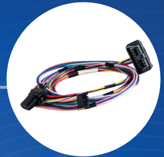
✓ OBD harness

With everything at hand, Trace5 installation is quick and simple.