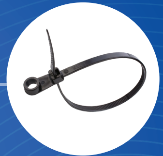
✓ Zip ties